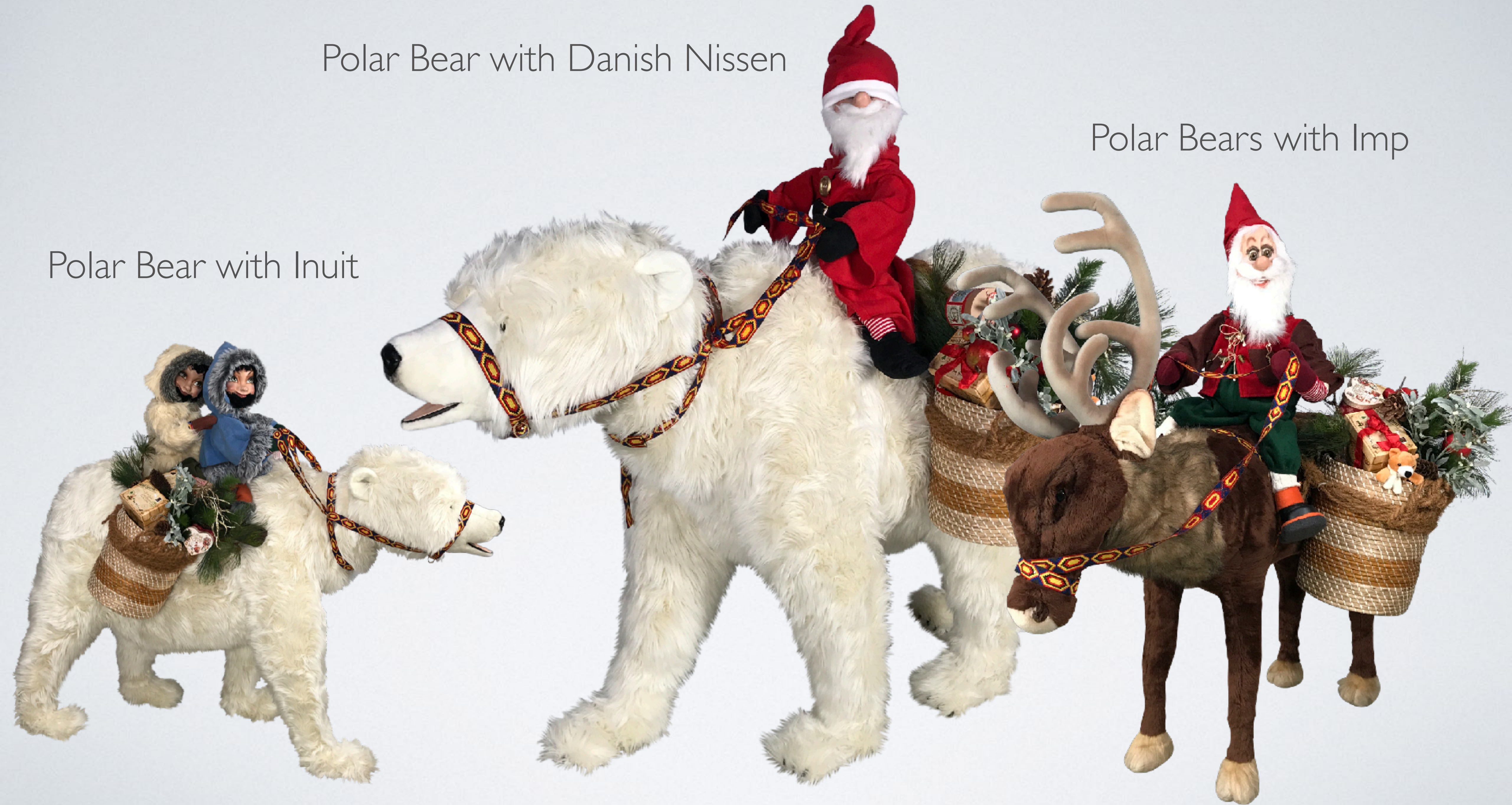
Polar Bear with Inuit