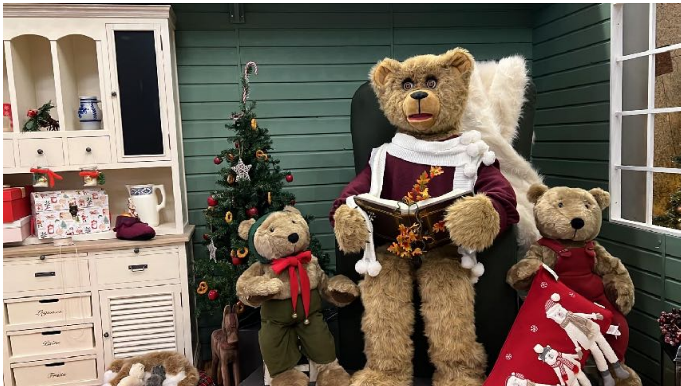
Realisation on a stage in a shopping centre in 2022